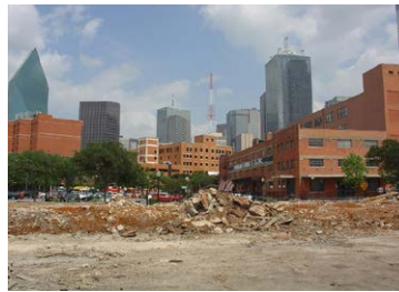
Remains of the MKT Depot

In 2006 the MKT Depot located in the West End Historic District was allegedly demolished without permission from the City of Dallas. The city filed suit against the property developer and in 2010 a jury decided the building had been illegally demolished and awarded the City of Dallas a $750,000 civil penalty. The developer appealed the case and in April of this year the appellate court reversed the decision of the lower court and vacated the earlier judgment saying that the City had not given proper notice to the developer of the historic status of the building and what rules they had to follow to get permission for demolition. The court also said that the city did not have the authority under the Texas Local Government Code to receive penalties from the developer as the code does not apply to violations of a zoning ordinance.