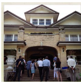
4949 Swiss Avenue