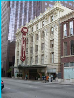
The Majestic Theater is a City of Dallas Landmark

2013 marks the 40th anniversary of the City of Dallas Landmarks program! To celebrate 40 years of the program the Dallas Center for Architecture will be holding an exhibit from May 7th until