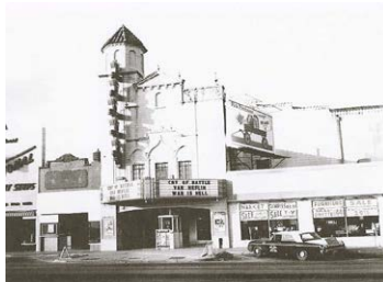
Texas Theatre in 1963