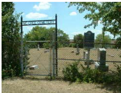
McCree Cemetery

Preservation Dallas just received a grant from the B.B. Owen Trust to help preserve the historic McCree Cemetery in the Lake Highlands area of Dallas. The first land for the cemetery was granted by Mahulda Bonner McCree in 1866, although at least two burials occurred before the cemetery was formally