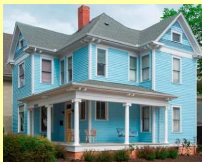
Patron Tour House 2600 Thomas Avenue

For more information on the tour and to purchase tickets, visit the tour page here .