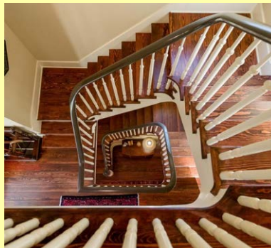
Patron Party House 2315 Routh Street

The tour of State-Thomas is this Sunday and our kick off Patron Party is Thursday! We have great tour properties, amazing speakers detailing the history of the neighborhood and incredible patron party and patron tour houses. We hope you will join us for this fantastic event!