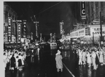
Theatre Row in Dallas in the 1940s.

6:00 PM Doors Open (Cash Bar Available) 6:30 PM Program