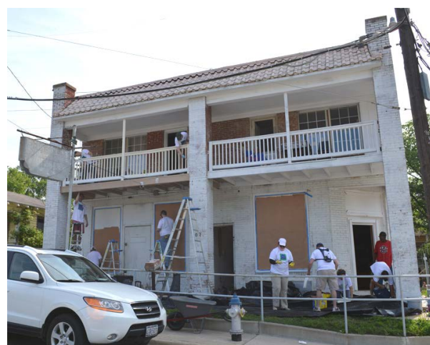
Preservation Dallas Volunteers busy at work painting 102 N. Cliff Street

On April 26, Preservation Dallas participated in Rebuilding Together's National Rebuilding Day in the historic Tenth Street neighborhood. Thirteen projects were completed that day by volunteers from across the city. Preservation Dallas and the Preservation Dallas Young Professionals had their own volunteer team working on two projects. Our main project was 102 N. Cliff Street, a former two-story commercial building in the neighborhood which is now home to the Mendez