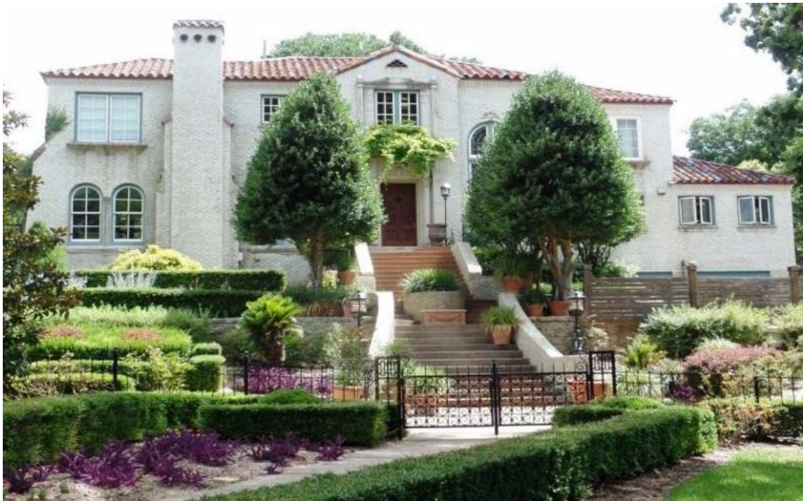
Binsford House, 1925