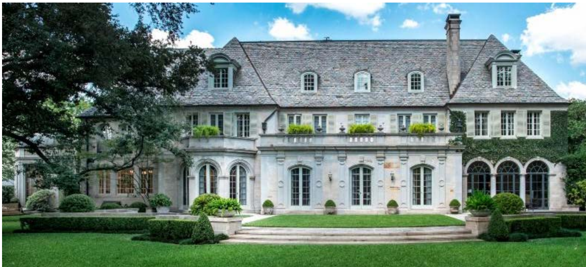
Owsley House, 1929