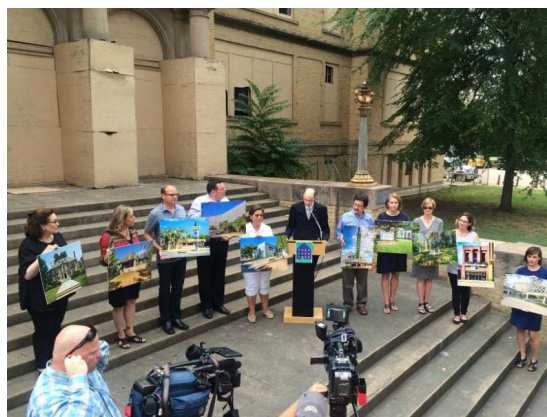
Announcement of the Most Endangered Historic Places list on September 15 on the steps of Old Dallas High School/Crozier Tech.

I hope everyone caught the press last month surrounding the announcement of the 2015 Most Endangered Historic Places. We were covered in many different media outlets which was great to see as that really helped get the message out about the threats many of our historic places are facing. We know we reached a lot of people as we were contacted about many of the sites on the list. To view the entire list click here . We also have a volunteer that has been working on compiling the information on the sites on our previous endangered lists. We will be posting that information soon to our web site after we get it formatted properly.