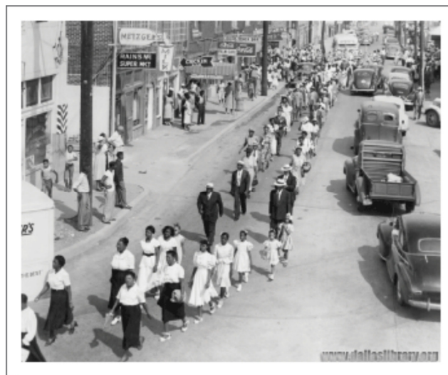
National Baptist Sunday School Congress Parade on Hall Street, June 8, 1949